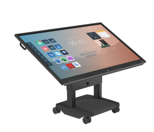
iPro Lift system